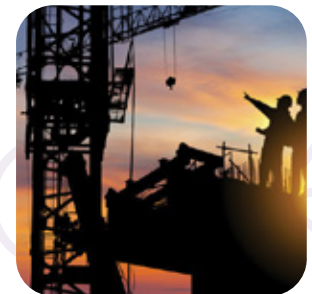
INFRASTRUCTURE & CONSTRUCTIONS