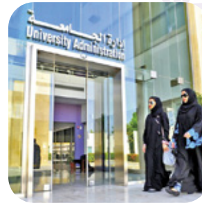
ACADEMIA & FIRMS