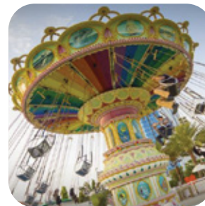
THEME PARKS & ENTERTAINMENT